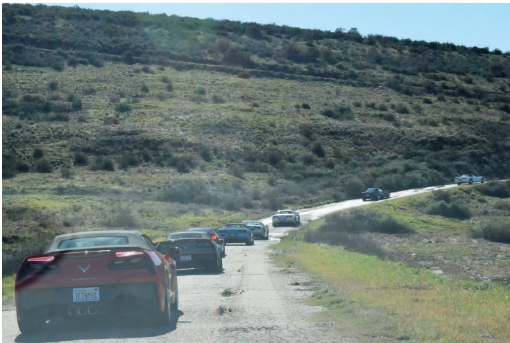
Traveling the backroads to the wineries.